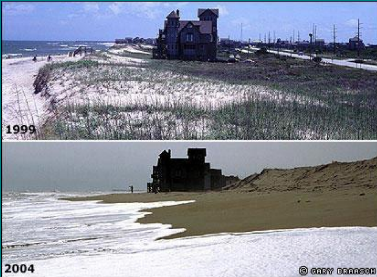
This is a section of shoreline at Cape Hatteras in North Carolina pictured in 1999 and 2004.