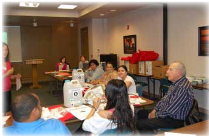
AmeriCorps volunteers are excited about using the Pesticides and Farmworker Health Toolkit to train tobacco, sweet potato, Christmas tree and other crop workers.