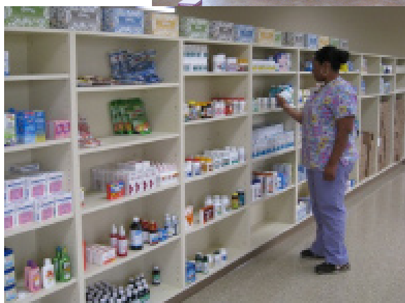
Below right, ECU Physicians Pharmacy drive thru.