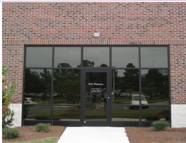
ECU Pharmacy at 517 Moye

At noon on Friday, October 8, 2010, Brody Outpatient Pharmacy closed the security windows and said good-bye to the location where they opened in 1999. This was not a sad occasion as the pharmacy had outgrown this space and was moving to a new location and getting a new name.