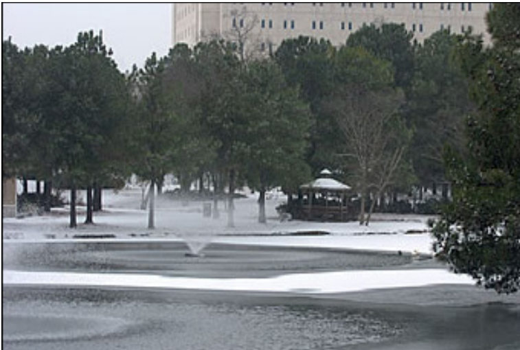
Left: A light layer of snow coated the campus of the Brody School of Medicine