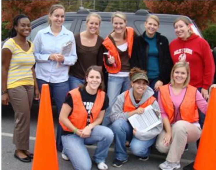
Occupational Therapy Students Complete Carfit Training

Nine first year occupational therapy students took a break from their end of semester studies to become CarFit Technicians. Although the plan was for them to participant in an event later in the week was rained out, each of the students successfully practiced and are ready and excited to plan and participate in future events in Greenville and their home communities. They join the rest of the occupational therapy students at ECU who embrace CarFit and plan to participate in events throughout the state.