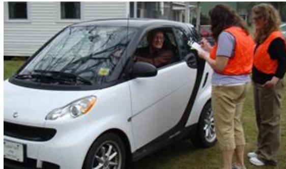
Students enjoyed teaching about CarFit and driving and meeting the older adults from the community.