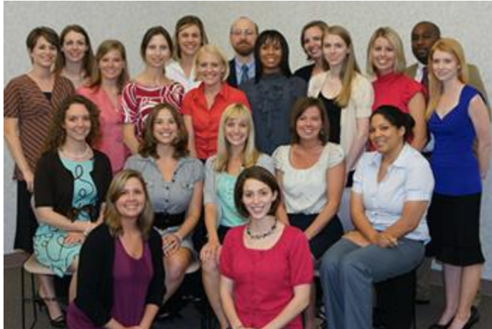
Class of 2009