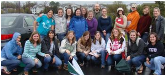
Occupational therapy students become CarFit technicians

Twenty-one occupational therapy graduate students came on a rainy Friday afternoon to become CarFit Technicians on March 27, 2009. This has achieved a total of 38 of the 40 current students trained in CarFit! This is awesome, as the activity is totally voluntary and service related to the community.