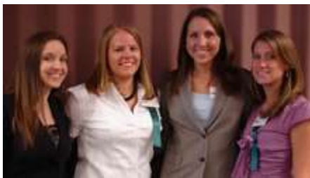
The four students gathered much of the data for their master's project.