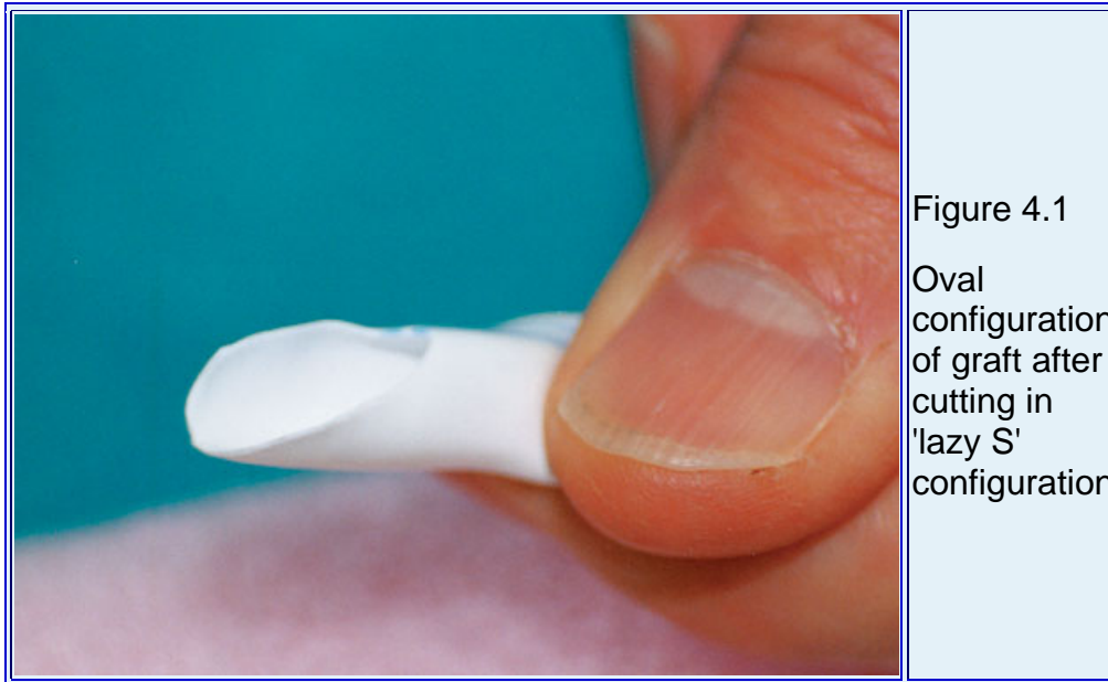
Figure 4.1 Oval configuration of graft after cutting in 'lazy S' configuration