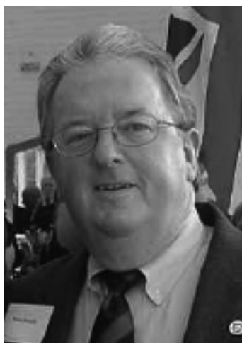
Professor & Dean

Thank you for your continued interest in ECU and HHP. Your success, energy and support, continue to be our greatest assets in advancing the College of Health and Human Performance.