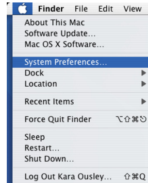
OS X Apple Menu