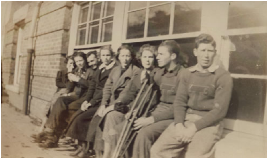
Unidentified group of students, ca. 1930.