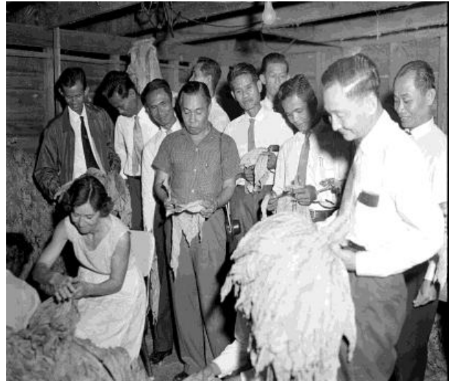
Agriculturalists from Thailand looking through tobacco leaves in a tobacco barn. Just one of many images that can be found in the "Seeds of Change" Collection.

"Seeds of Change" features more than 7,500 images digitized from the photographic negatives used in The Daily Reflector , Greenville's daily newspaper, between 1949 and 1967. These photos document the trends and developments that influenced the eastern region of North Carolina during this period of major change in the United States. The collection's website also contains supplemental multimedia resources that offer historical context for the images, including a streaming video and full transcript of an interview with the newspaper's former editor and photographer, an essay written by ECU history faculty member Christopher Oakley on the history of Pitt County and Greenville during this period, and an illustrated timeline identifying national and international events that shaped the era. The resource also contains tools for browsing the images by subject, facilitating users' easy entry into the collection. The digital exhibit's homepage can be found here .