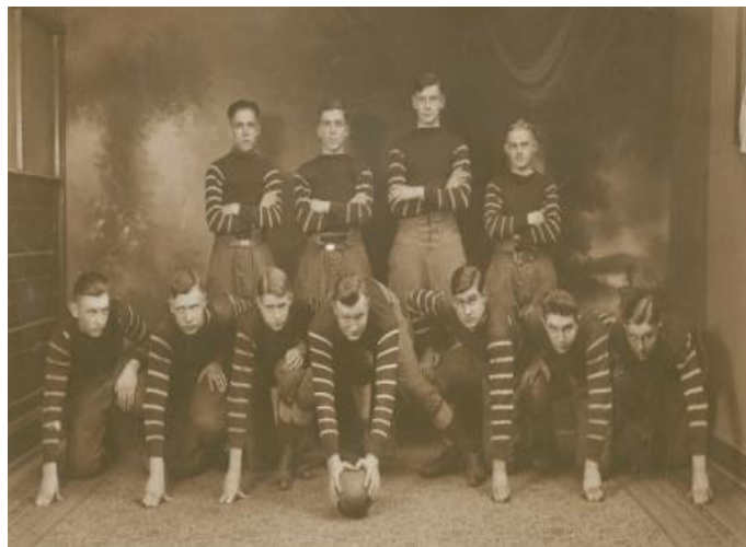
From the Wright Collection: The Austin High School (Minnesota) football team with american poet Richard Eberhart (2nd from the left, back row) as captain and quarterback (ca. 1920).