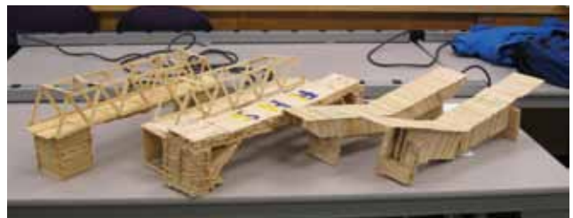
Popsicle bridge presentations.