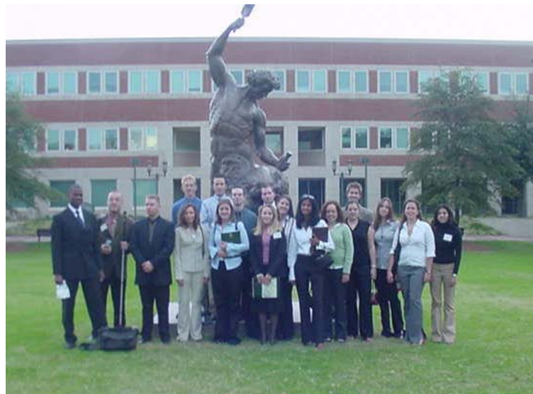
The Model United Nations Club at a conference in Charlotte, NC