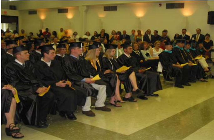
Spring 2003 graduates with parents and friends at the department's commencement ceremonies.